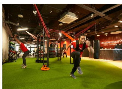
(Left to right: Action Motion, Mancaves, Fitness Workz Garage)

The Bedok Reservoir Clubhouse features an exciting array of first-of-its-kind facilities, suitable for patrons of all ages. This includes: